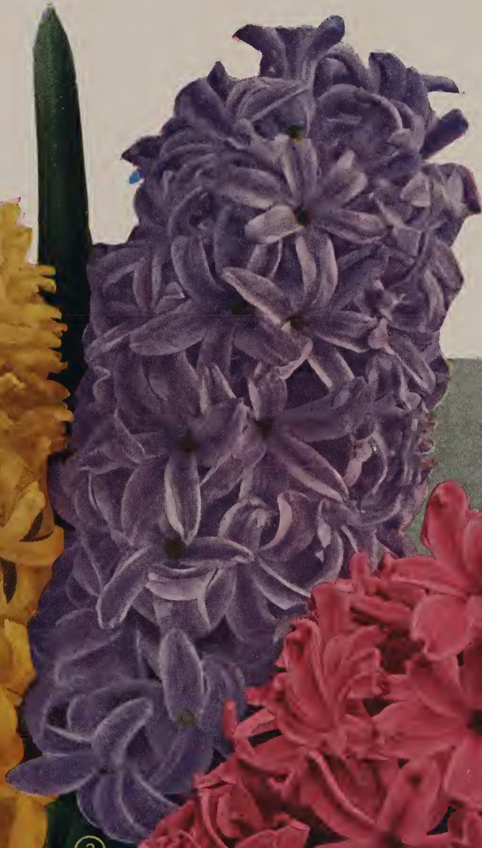
Matchless Light Blue